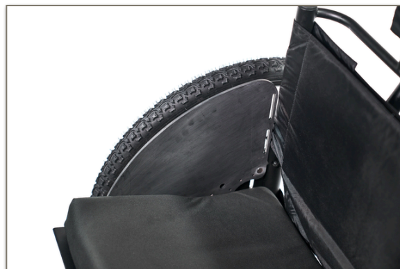
Finished look at installed Side Guard.