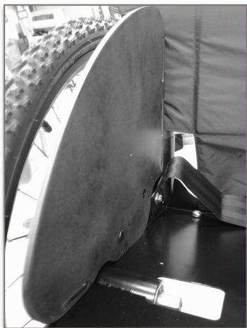
Shown with seat cushion removed.