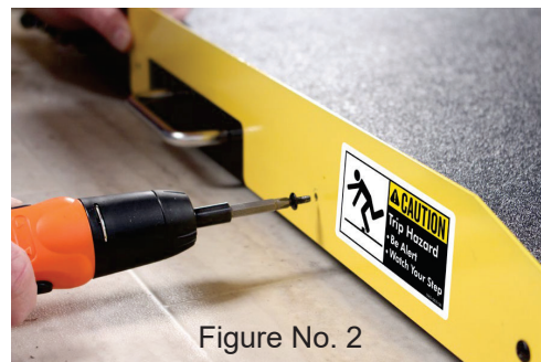
Figure No. 2