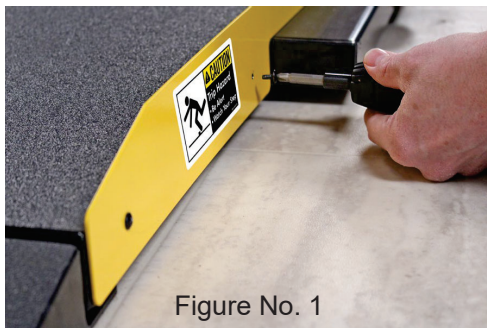
Figure No. 1