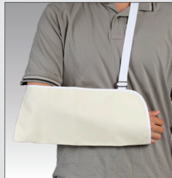
CRADLE SLING ECONOMY

*The X-large has a 5" longer shoulder strap.