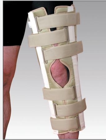
DELUXE THREE-PANEL KNEE IMMOBILIZER