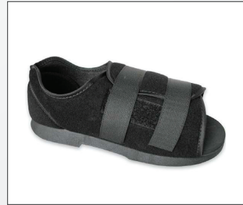
SOFT TOUCH POST OP SHOE

This economically priced semi-rigid post op shoe is ideal for the sensitive foot. A soft cotton-poly blend breathable upper will keep your patient both cool and comfortable. The hook and loop closure provides even tension and compression. The reinforced heel counter provides additional comfort and support for your patient. The black TPR outsole is flared in the heel area to provide better medial/lateral stability. The outsole has the famous Health Design notch to give it a more shoe-like profile. Ideal for use following surgery, as well as for post trauma, dislocations, burns and the foot sensitive patient.