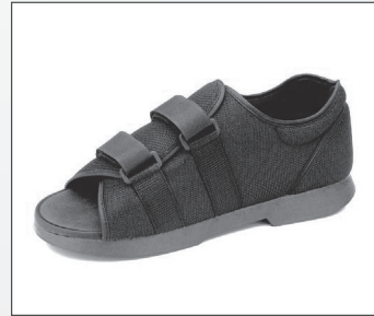
CLASSIC POST OP SHOE