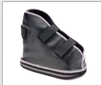
VINYL CLOSED TOE CAST BOOT