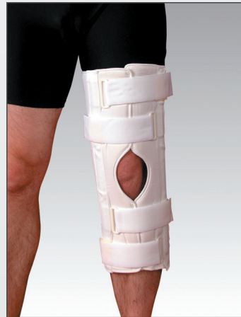
DELUXE POST-OP KNEE IMMOBILIZER