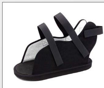
CANVAS / OPEN TOE CAST SHOE