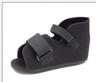
POLYCAST CAST BOOT