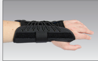
BUNGEE WRIST SPLINT

The Bungee Wrist Splint has an easy to use bungee strap allowing the wearer to make quick adjustments without assistance. Designed to help provide compression. The hook & loop closure allows for easy adjustment. Removable aluminum palmar spoon with an aluminum dorsal stay. Black exterior with blue interior.