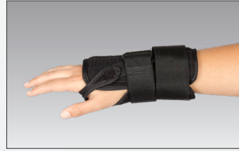
BLACK FOAM WRIST SPLINT

This premium wrist splint features a tri laminate material with a white cotton lining, and a brushed nylon exterior. A dorsal aluminum support and a split contoured aluminum palmar stay help immobilize and support the girth changes in the forearm. One adjustable hook and loop fastener strap, and one loop lock strap firmly secure the splint to the wrist. A foam strip provides increased comfort over the palmar stay. Available in black.