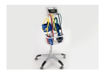
ACC-VAS-013 Pole Stand/Trolley (Requires Fixing Plate)