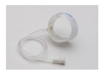
ACC162 Large Digit/Toe Cuff with Colder Connector (2.5cm pack of 5)