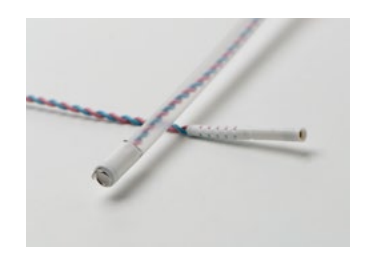
ACC-7000AA0 Qwik Connect Spiral Electrodes Single Helix (Box of 50)