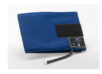
ACC-OBS-073 Medium BP Cuff (24-32cm)