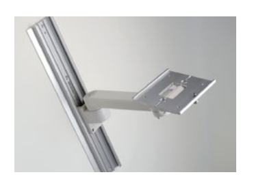
ACC-VSM-154 Wall Mount (Requires Fixing Plate)