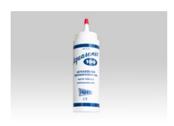
ACC3 Aquasonic Gel (Box of 12 x 250ml)