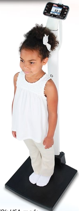
DETECTO's USA-made apex® scales measure weight and height efficiently on patients of all ages and sizes.

DETECTO's icon® eye-level digital clinical scale has a dual-ranging capacity of 0.2 lb/0.1 kg up to 600 lb/300 kg and 0.5 lb/0.2 kg up to 1,000 lb/500 kg. The low-profile 17 in W x 17 in D platform is nearly flat at only 1.5 inches high. The icon® includes a non-medical grade standard AC adapter or can be powered by 12 AA batteries (not included). The touchless sonar height rod allows you to simply step on the scale and within seconds weight, height, and Body Mass Index will all be displayed onscreen without touching a single key.