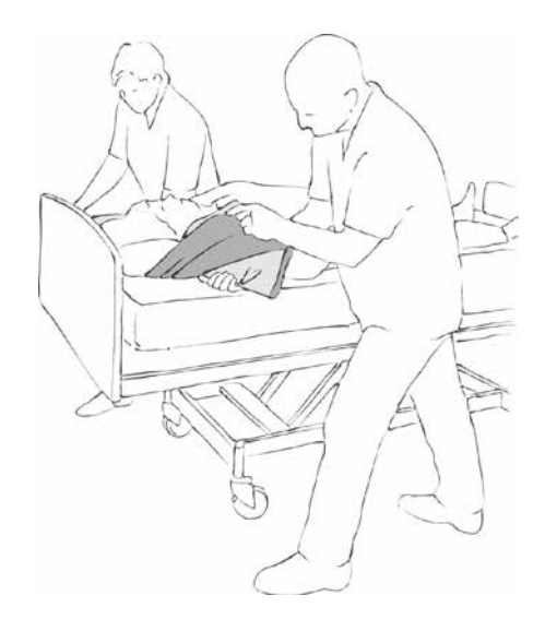
Illustration 1 Illustration 2