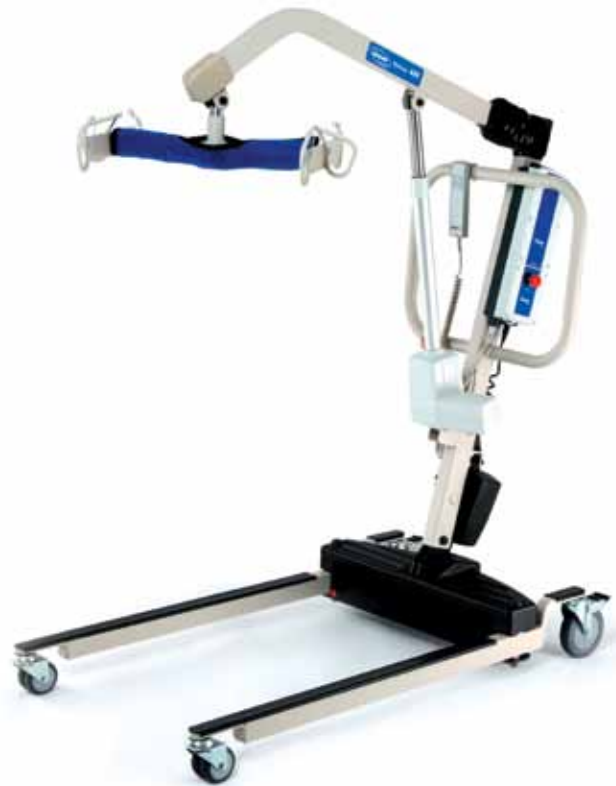
RPL600-2: Powered with power opening low base