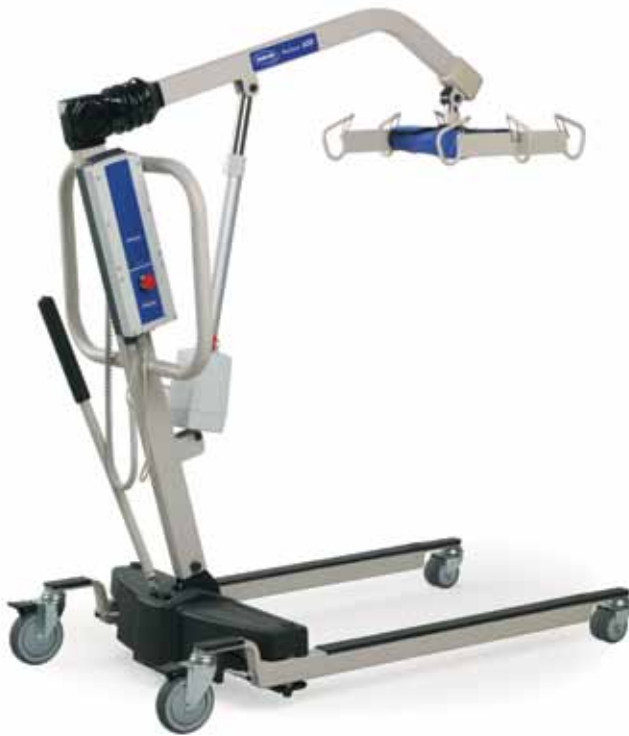
RPL600-1: Powered with low base