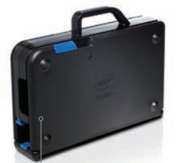
The Intel Portable Capture Station folds up for portability or storage