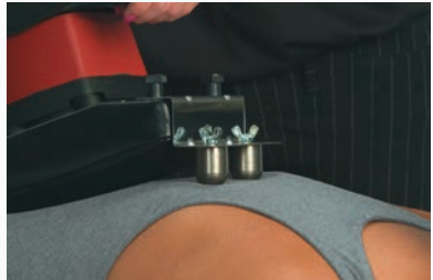
Close-Control Spinal Massage