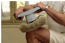
Knee with Sheepskin Pad Cover