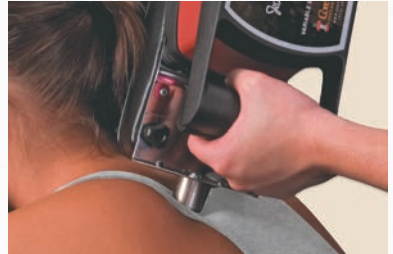
Trigger Point Massage