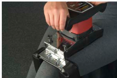
Adjustable Cuff for Pin-Point Massage