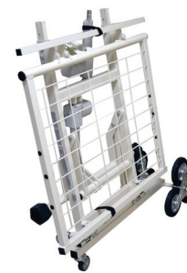
Transport Dolly and Stair Climber