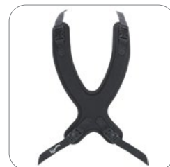
Contoured Chest Harness