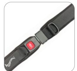
Padded Center Pull Pelvic Belt