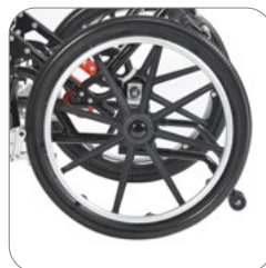
12" Rear Wheel Assembly