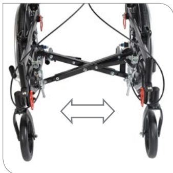
Adjustable Width Crossbrace