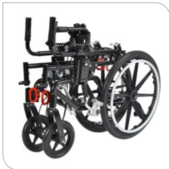
Folds for Easy Transport