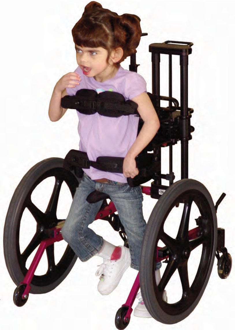
Unit shown with optional Lateral Chest System and Headpad

All specifications subject to change without notice.