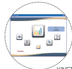
KINETEC DATA CAPTURE™