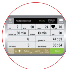
7-inch touch screen

Because patient safety is key, the KINETEC KINEVIA™ will provide through its user friendly interface different levels of activity according to the patient condition as well as a unique & adjustable spasm control feature.