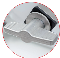
Easy & tool-free pedal adjustment