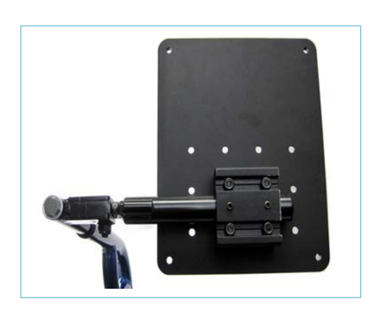
Multi adjustable footplate ensures comfort and safety