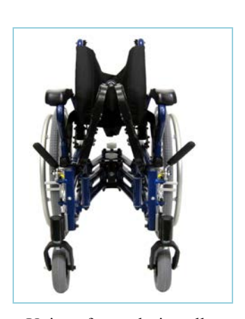
Unique frame design allows for easy and compact folding