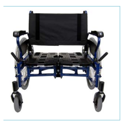
Fully customizable seat allows for greater seat width, depth, and overall better positioning for any patient

Our unique frame design is multiadjustable and has a maximum weight capacity of 550 lbs.