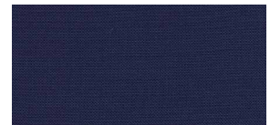
SILVERTEX SAPPHIRE BLUE