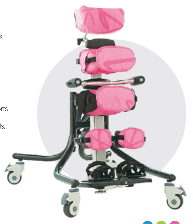
Available in 3 fabric colors