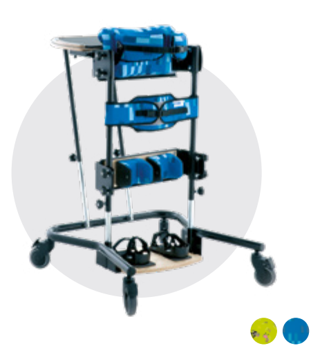
Size 1 only available in Meadow Fabric. Size 2 & 3 only available in Mondeo Fabric.