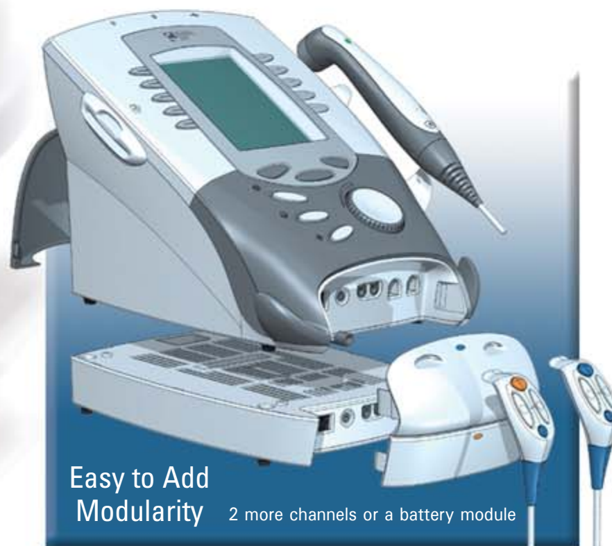
Easy to Add Modularity 2 more channels or a battery module