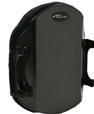
JETSTREAM PRO® BACK SUPPORT SYSTEM