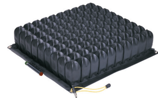
HIGH PROFILE® QUADRO SELECT®