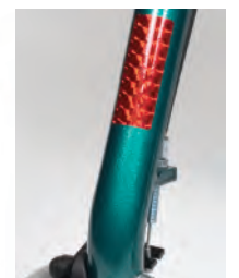
Rear Reflectors increase visibility at night!

This lightweight Walkabout Junior rollator is ideal for the petite or junior user. It is designed with a smaller frame, weighs only 12.5 lbs and has 6" wheels.