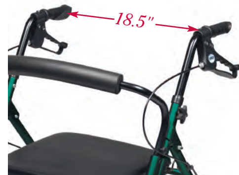
WIDE rollators offer 18.5" between handgrips and larger seats for added comfort

Designed for the user who is "in between sizes" of a standard or bariatric rollator, this Walkabout Wide offers more room and added comfort. The wider frame features an 18.5" wide opening in between the handgrips, a 15.5" wide padded seat and a 350 lb maximum weight capacity EVENLY DISTRIBUTED.