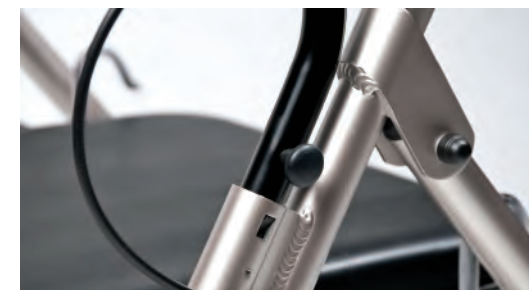
Easy grip knob makes for simple backbar removal for storage and transport.

Available colors *Color offerings vary for different models.