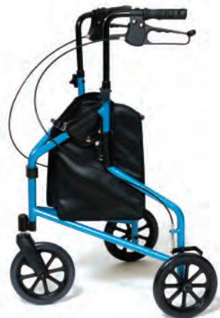
GF 3-Wheel Cruiser Item 609201