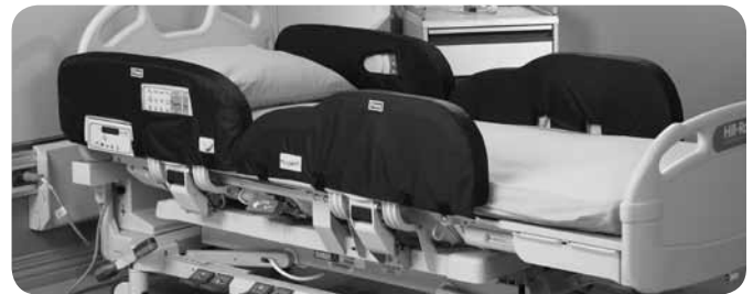
Model 5743 - Hill-Rom® VersaCare® Bed

Advance, Advanta, Affinity, CareAssist, Century Plus, Resident, TotalCare and VersaCare, are registered trademarks of Hill-Rom® Services, Inc. Med-Mizer is a registered trademark of Med-Mizer Inc. Go-Bed II, In-Touch, Secure, S3 and Stryker are registered trademarks of the Stryker® Corporation.