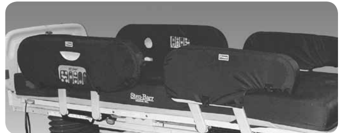
Model 5755 - Stryker® Secure I & II® with Rounded Side Rails