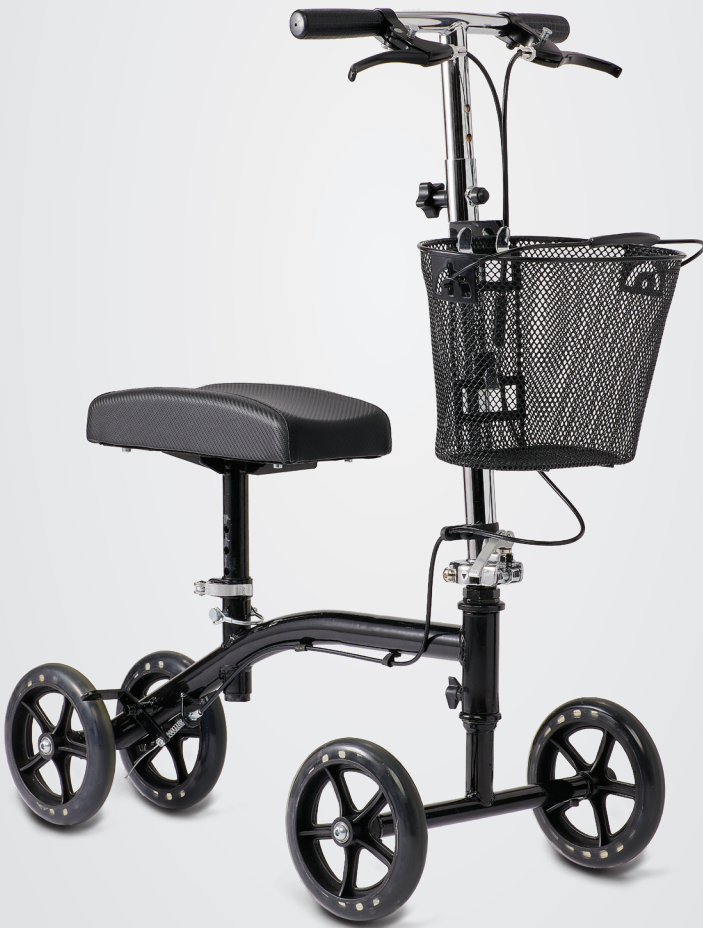
Four Wheeled Kneewalker