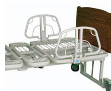
¼ Length Side Rails