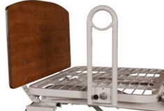
Pivoting Assist Bars