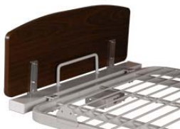
4" Bed Extender