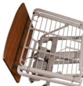
42" Bed Width Kit