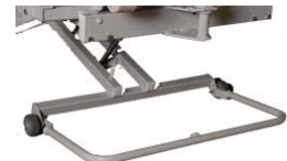
Floor Bumper Guard