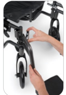
Detachable Arm & Foot Rest Available with a Swing Away & Elevated Foot Rest