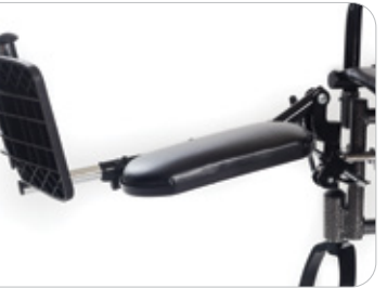
Removable & Adjustable Elevated Leg Rest