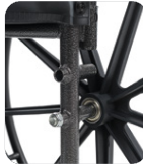
Dual Axle Adjustable Seat Height