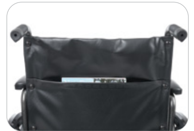
Large Storage Pocket on Back of Seat