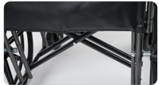
Dual Crossbar for Extra Support