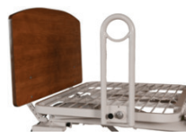
Pivoting Assist Bars