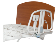
1/4 Length Side Rail with or without Fixed Handset