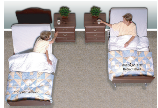
Fall Risk Non-Retractable Bed