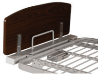
4" Bed Extender