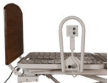
Pivoting Assist Bars with Fixed Handset