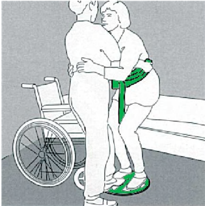
(Figure 2) - Transfer between bed and wheelchair