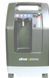
DEVILBISS 10 L O2 CONCENTRATOR $1575