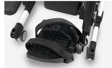
962 Footrests + Heelrests