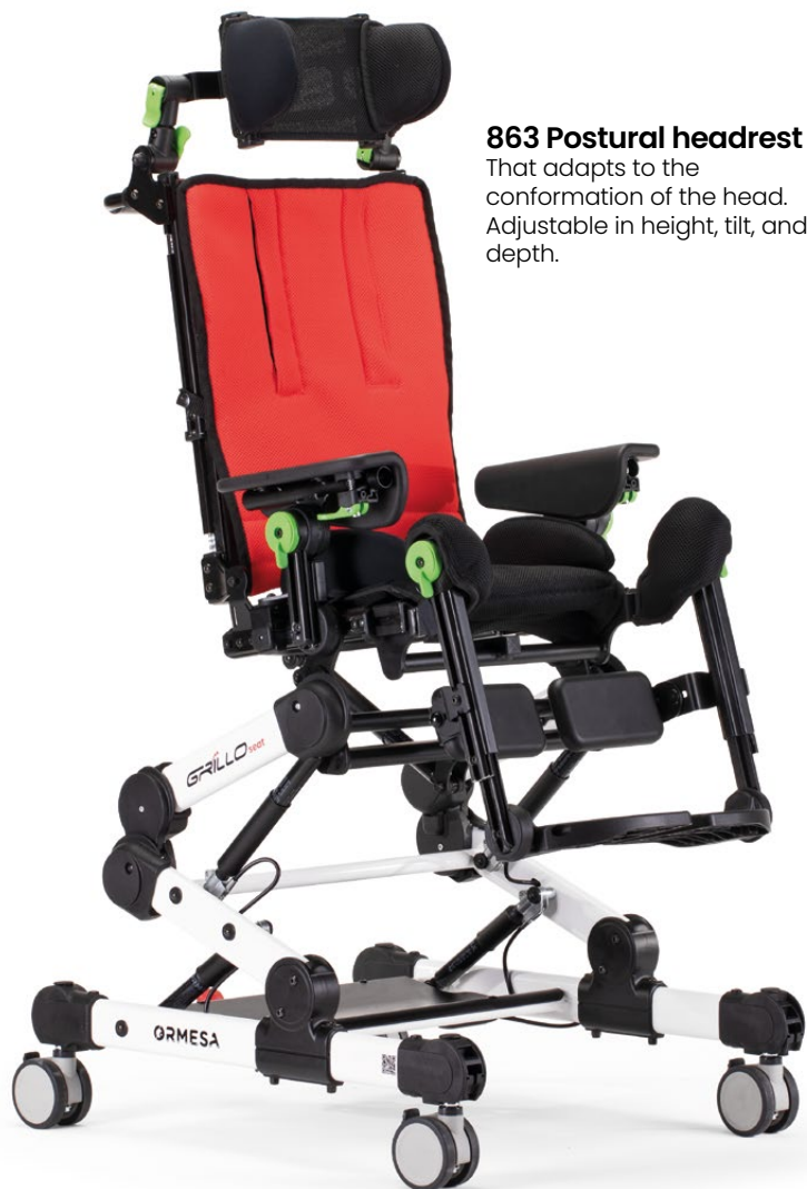
863 Postural headrest That adapts to the conformation of the head. Adjustable in height, tilt, and depth.