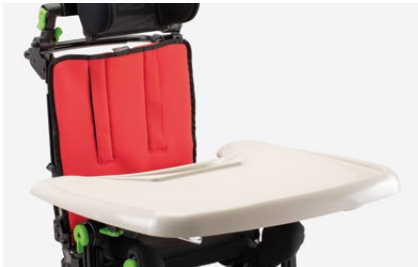
824 Tray with wrap-around recess Adjustable in depth, height and tilt with armrests.

It is made of resistant and hygiene material, no edge design, it does not retain any residue of food.