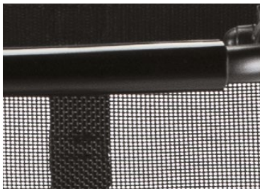
Load bearing upholstery

> Removable cover is made by very breathable and high quality material both internally and externally. The inner padding has a highly innovative leading edge structure , that is three-dimensional, lightweight , providing extremely high air circulation, optimal weight distribution and excellent comfort. The external fabric is highly resistant to abrasion too. Fire retardant according to EN 1021-1:2014 and EN 1021-2:2014 standards.