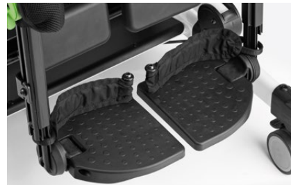
960 Heel rests

It is made of resistant and hygiene material, no edge design, it does not retain any residue of food.