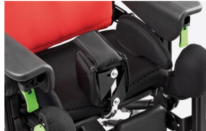
834R Adjustable abduction block in depth and abduction. Available in two sizes.