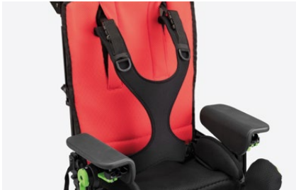
853 slim Four point shaped harness