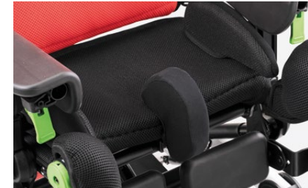
834N Narrow abduction block Adjustable in depth along with the seat. Available in two sizes.