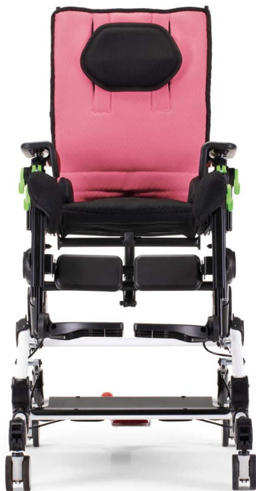
835 Shaped headrest with lateral and occipital support, adjustable in height.