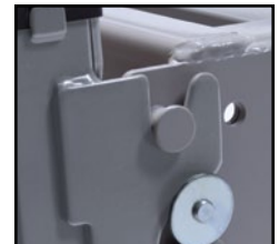
Locking pins secure frame to sleep deck

Designed and engineered by the same team who develop the GF Long Term Care beds.