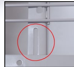
Slots in frame ensure proper rail placement