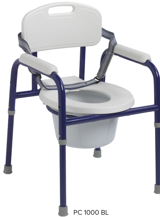
PC 1000 BL