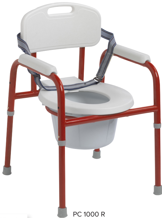
PC 1000 R