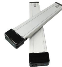
Lithium battery * 2 pcs