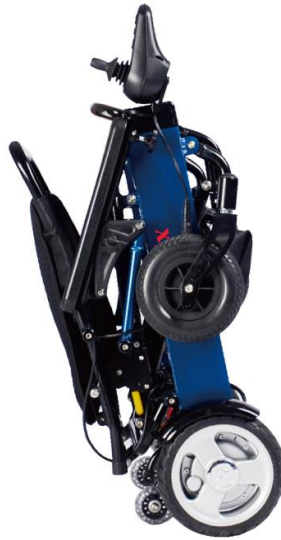
Chair, main assembly