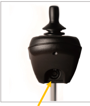
Controller Charge port