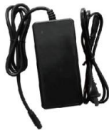
Charger with power cables