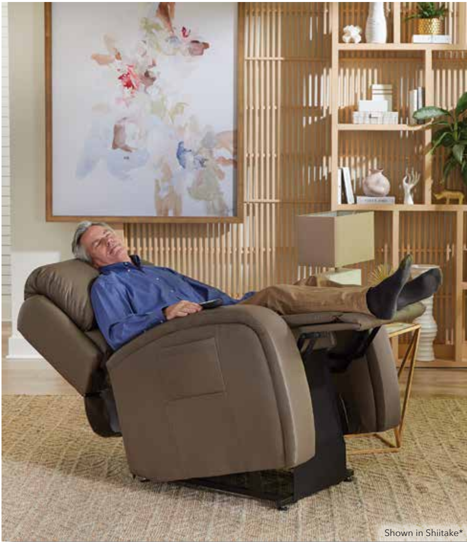
Shown in Shiitake*