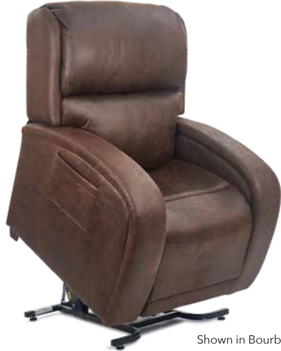
Shown in Bourbon

The World's Most Advanced Power Positioning Lift Recliner with Patented Twilight Technology!