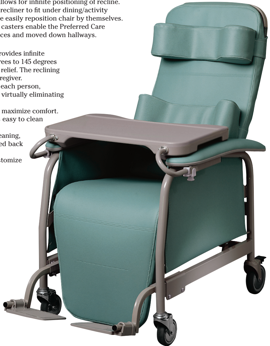
Tray Table and bolsters sold separately and are not included with recliner.