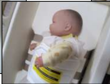
Small and Large Side Facing Restraint Bags