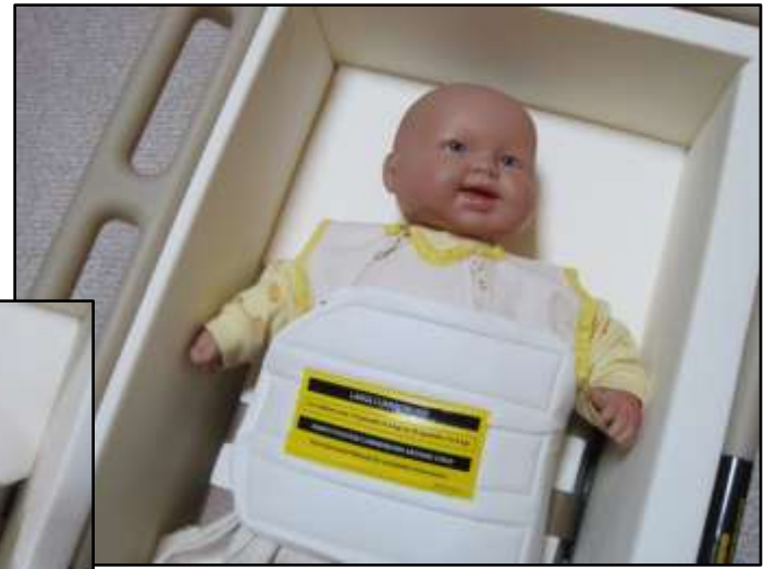
Large Restraint Bag 10 to 35 pounds