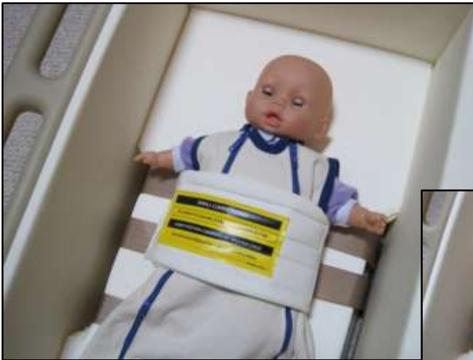
Small Restraint Bag 4.5 to 10 pounds