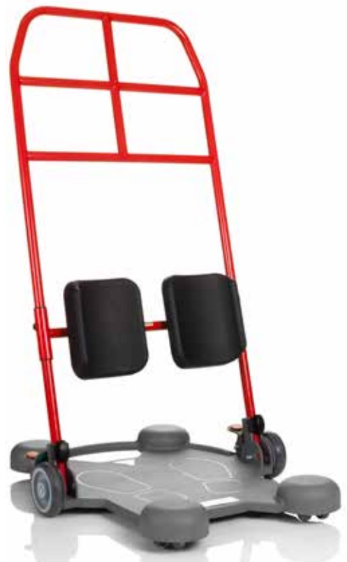
ReTurn7600 has been developed for larger and heavier users weighing up to 205 kg/450 lbs.