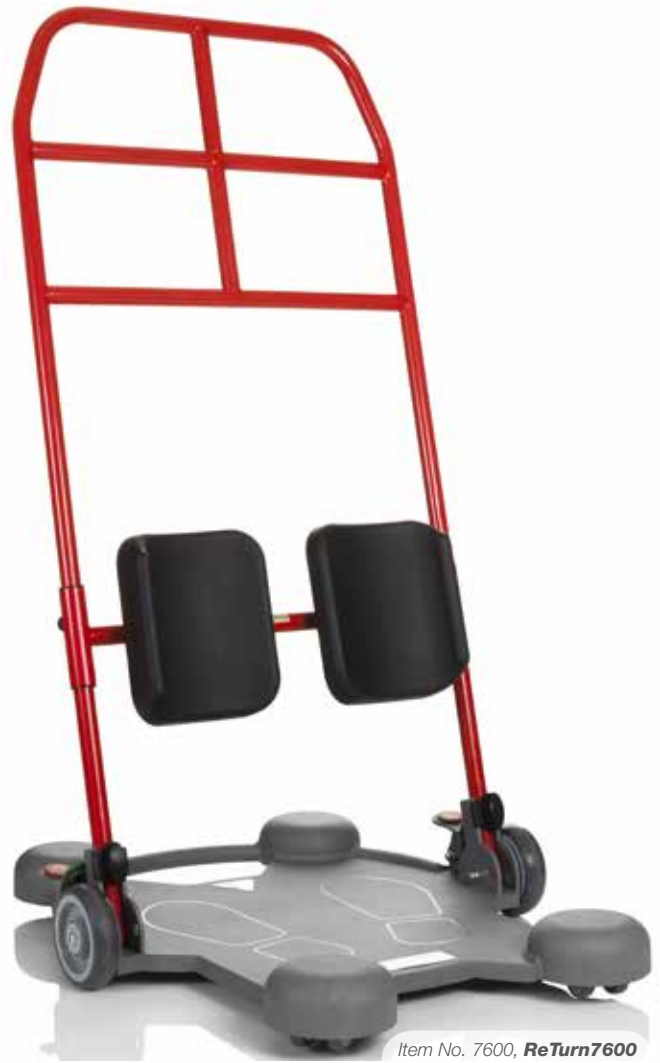
Item No. 7600, ReTurn7600