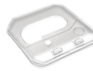
H5i flip lid seal 36892