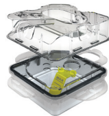
H5i cleanable water tub (MPMU) 36800