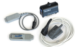
S9 complete oximetry kit 2 369100