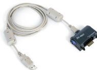
S9 USB adapter 36950