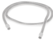
Standard tubing • 6'6" replacement standard tubing 14987