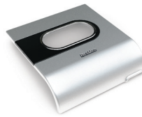
H5i flip lid 36891