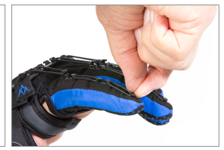
Fig. 32 Reattach DIP Tensioner for all fingers