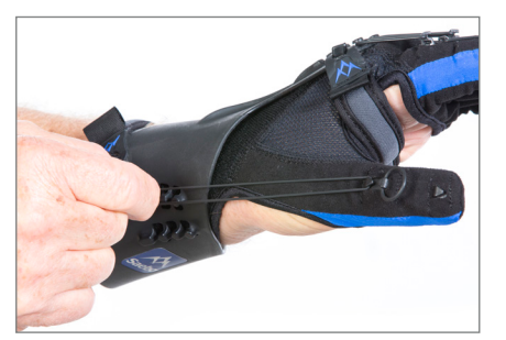
Fig. 33 Attach Thumb MCP Tensioner