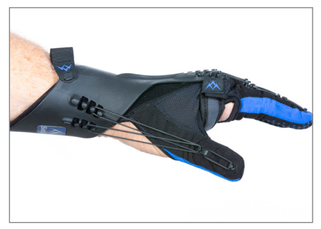
Fig. 17 Apply 1 Tensioner each around both Thumb Attachment Sites