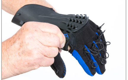
Fig. 25 Detach Forearm & Hand Straps