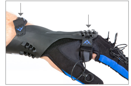
Fig. 30 Attach forearm & hand straps