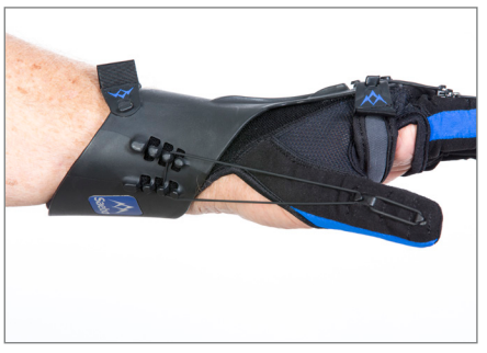
Fig. 16 Apply 1 Tensioner around both Thumb Attachment Sites

Because the thumb allows for multi-planar motion, various strategies may be required in order to position it correctly. Although, most clients will only require 1 Tensioner to be attached to the Thumb Attachment Site, consider the following if needed: