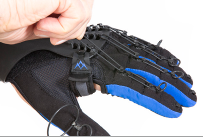
Fig. 31 Reattach MCP Tensioner for all fingers