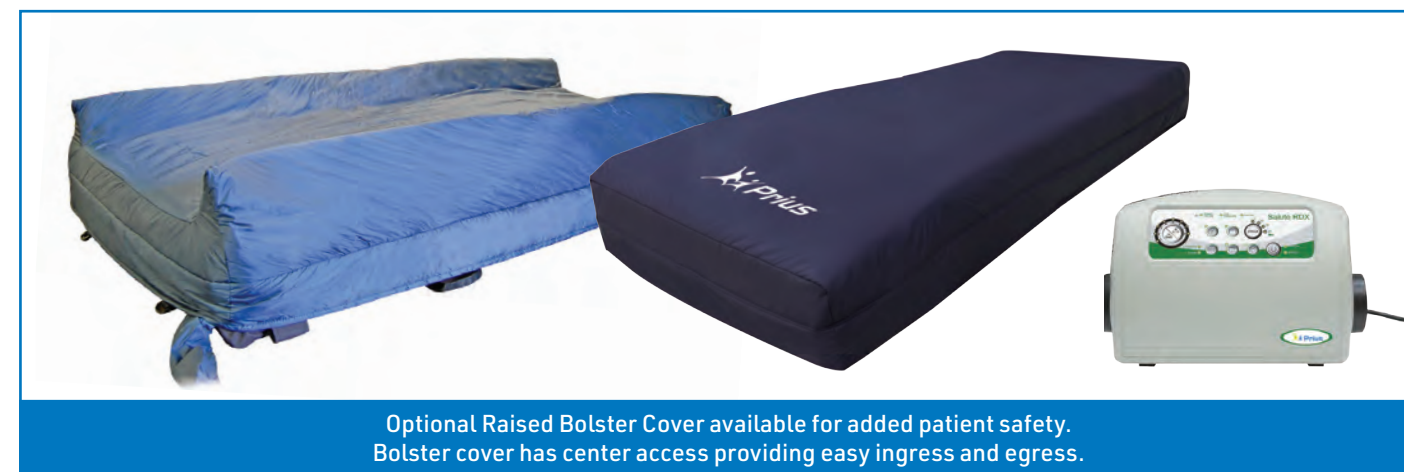
Optional Raised Bolster Cover available for added patient safety. Bolster cover has center access providing easy ingress and egress.