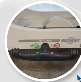
Hydraulic Foot Pedal