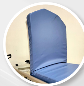
Back Rest goes up to 90°