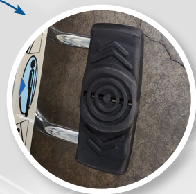
One Step Locking Mechanism on all Four Sides