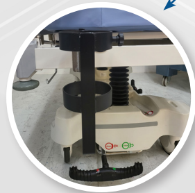
Fitted Oxygen Tank Holder