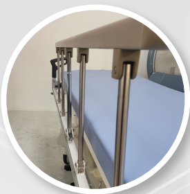
Adjustable Side Rails