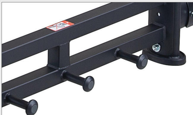
Resistance band pegs