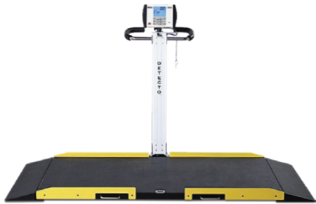
DETECTO model 8550 shown with optional yellow guide rails