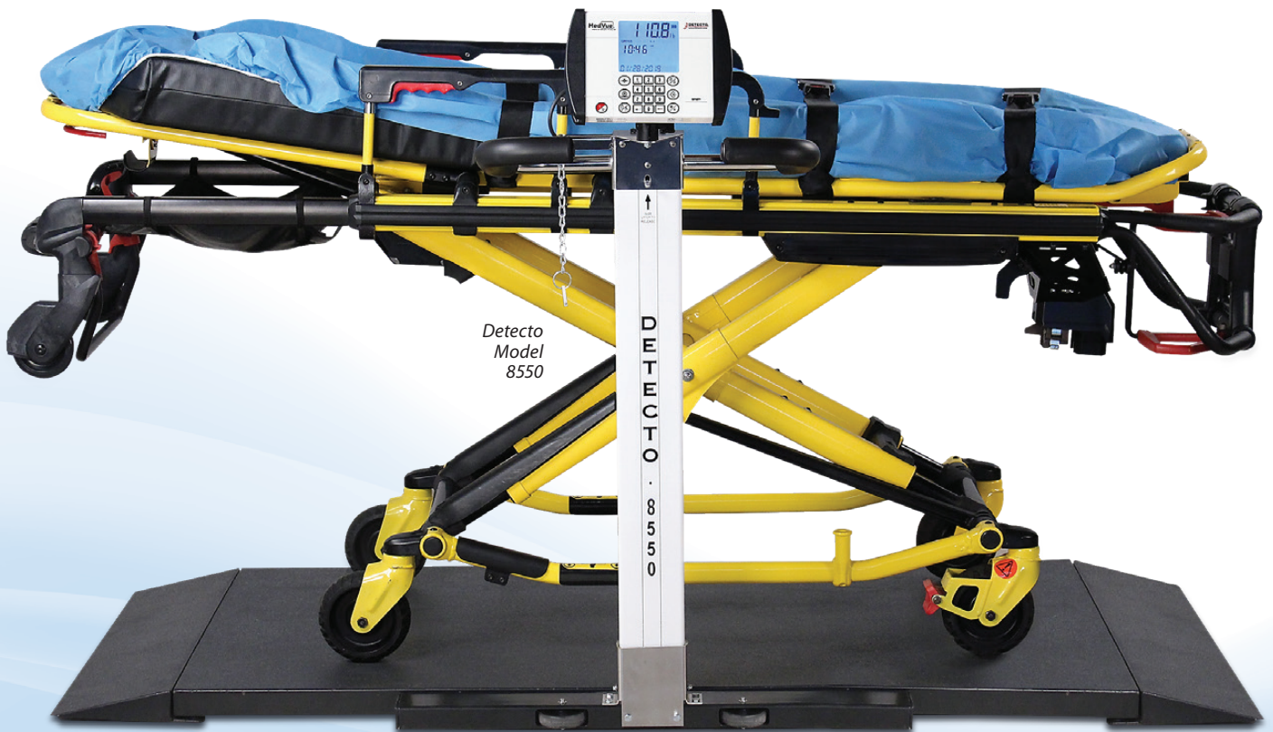
Detecto Model 8550