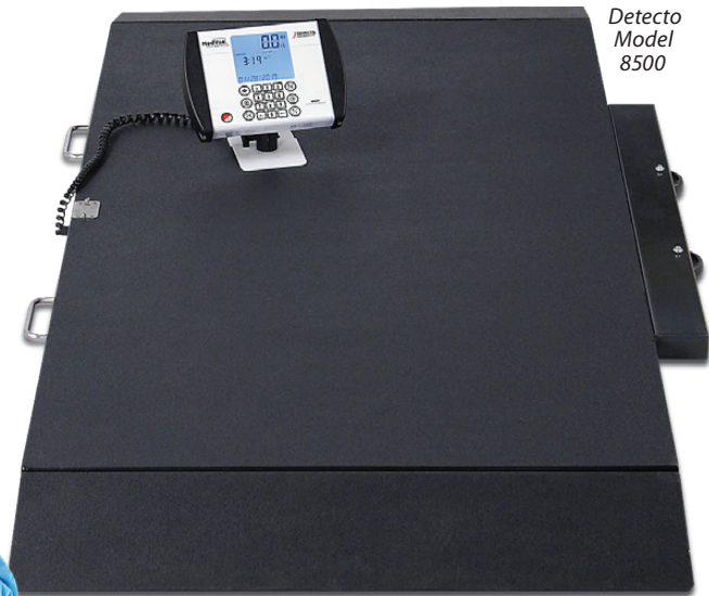
Detecto Model 8500