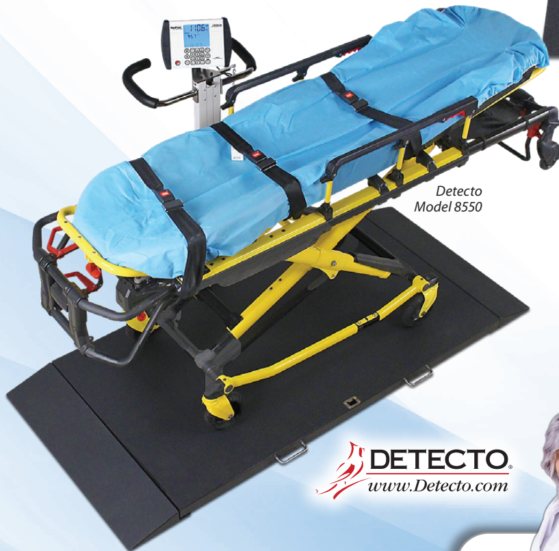
Detecto Model 8550