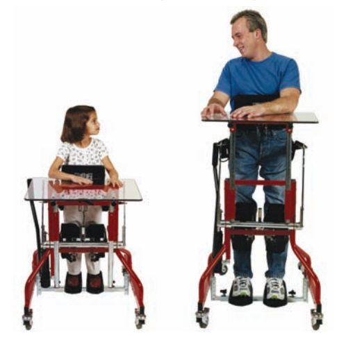
Granstand III Modular Standing System