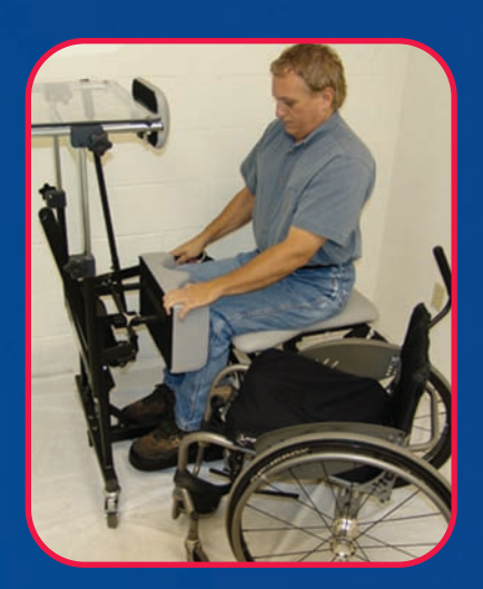
Flip down the knee support.