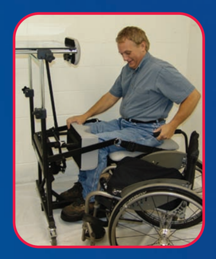
Flip the armrest back into postion.