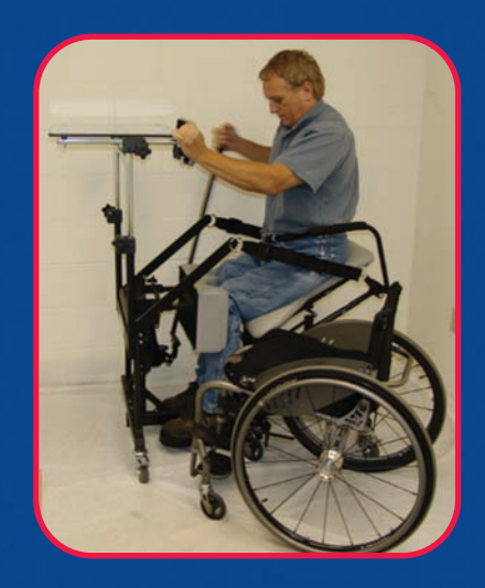
Pump yourself to standing.