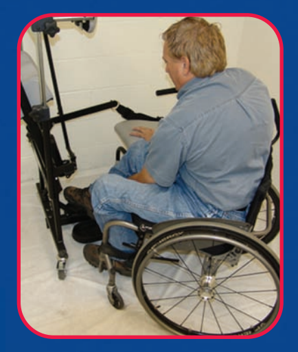
Place your feet into the frame.