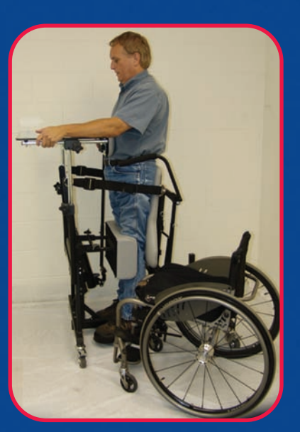
Finish by bringing yourself to a fully upright weight bearing posture, supported and properly positioned.