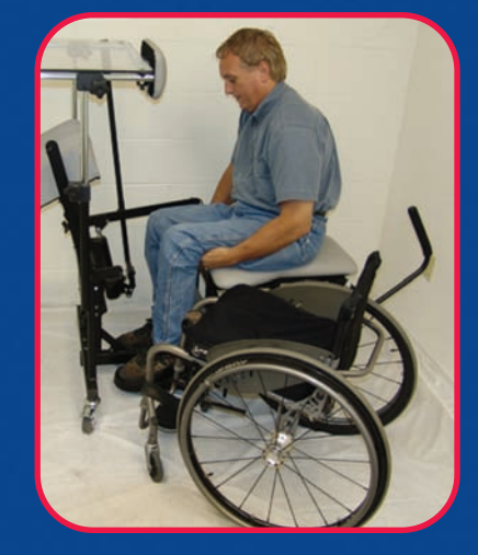
Position your feet in the shoe holders.