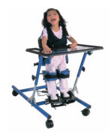
Superstand / Superstand Youth Pediatric Multi-Position Standers