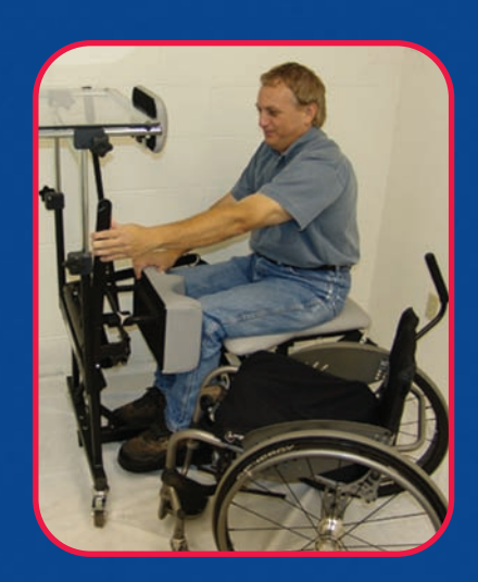
Flip down the lift arm.