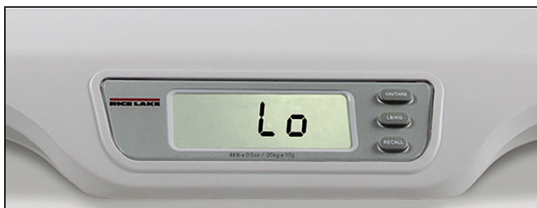
Figure 2-2. Low Battery Indicator

The RL-DBS can also be powered by four AA alkaline batteries if an additional power source is not available. A battery powered scale automatically turns off after two minutes of not being used to save battery life. Replace the batteries or connect to an AC power source as soon as possible if the low battery indicator ( Lo ) displays.