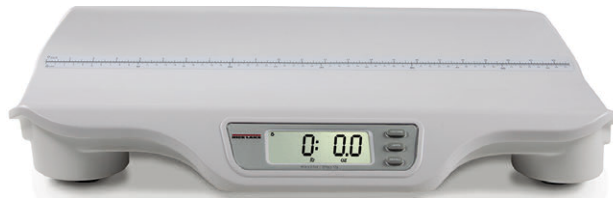
Figure 1-1. RL-DBS Digital Baby Scale

The Rice Lake Digital Baby Scale (RL-DBS) provides precise weighing of babies for accurate, reliable and repeatable weighments. Movement compensation technology eliminates errors caused by spontaneous movement of the baby and the weight can be displayed in pounds/ounces or in kilograms.