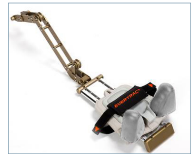
Cervical Attachment & Head Pillow