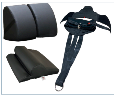
Knee & Cervical Bolster Set and Traction Belt