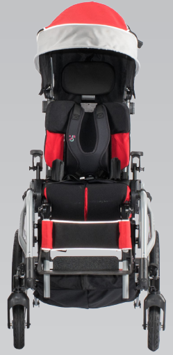
TRAK™ 14 TRAK™ 12