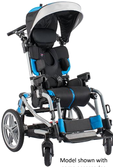
Model shown with some accessories