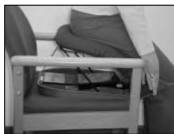
Lowering the lifting cushion To lower into a seated position, gently push downward on the power lever.

Note: Please remember that it is neither necessary, nor advisable to keep pushing/pulling on the lever once the motor has started.