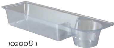
10200B-1 Additional Inserts Sold Separately.