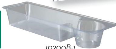
10200B-1 Insert Included! Additional Inserts Sold Separately.