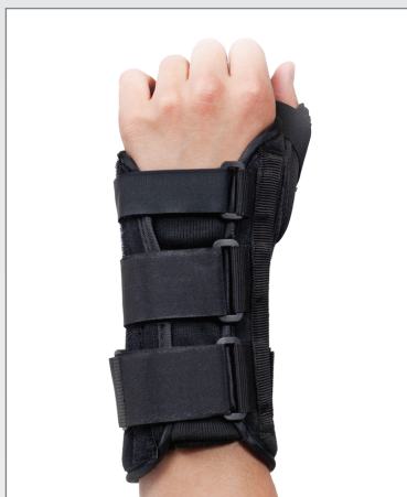
VertaLoc® Wrist Brace with Thumb Spica

This brace features a fully adjustable strapping system to ensure a custom fit. Its durable design allows for a long product life. The VertaLoc® Wrist with Thumb Spica is hand washable for easy cleaning. The wrist brace is available in a wide variety of sizes for right and left hand.